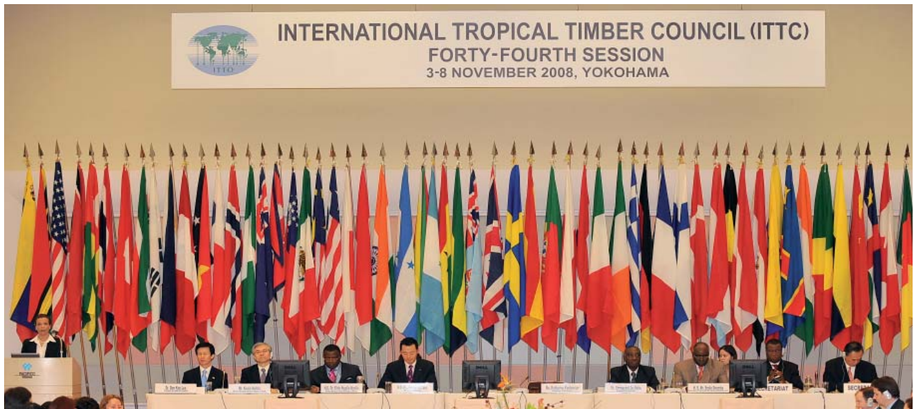
Dais at the Forty-fourth Session of the International Tropical Timber Council (ITTC) and Associated Sessions of the Committees