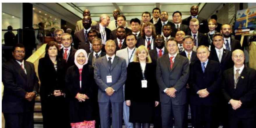
Group photo with Ministers attending the PIC COP 4 High-Level Segment

The fourth meeting of the Conference of the Parties (COP 4) of the Rotterdam Convention on the Prior Informed Consent Procedure (PIC) for Certain Hazardous Chemicals and Pesticides in International Trade convened from 27-31 October 2008, in Rome, Italy. COP 4 adopted 13 decisions, including the addition of tributyltin compounds, pesticides used in antifouling paints for ship hulls that are toxic to fish, molluscs and other aquatic organisms, to Annex III of the Convention (Chemicals subject to the PIC procedure). The meeting also adopted the recommendation of the Ad Hoc Joint Working Group on Enhancing Cooperation and Coordination among the Basel, Rotterdam and Stockholm Conventions. Issues unresolved and forwarded to COP 5 included those on: compliance, effective implementation, and listing of chrysotile asbestos, the most commonly used form of asbestos and cause of mesothelioma, and endosulfan, a pesticide widely used in cotton production, in Annex III ( http://www.iisd.ca/chemical/pic/cop4/ ).